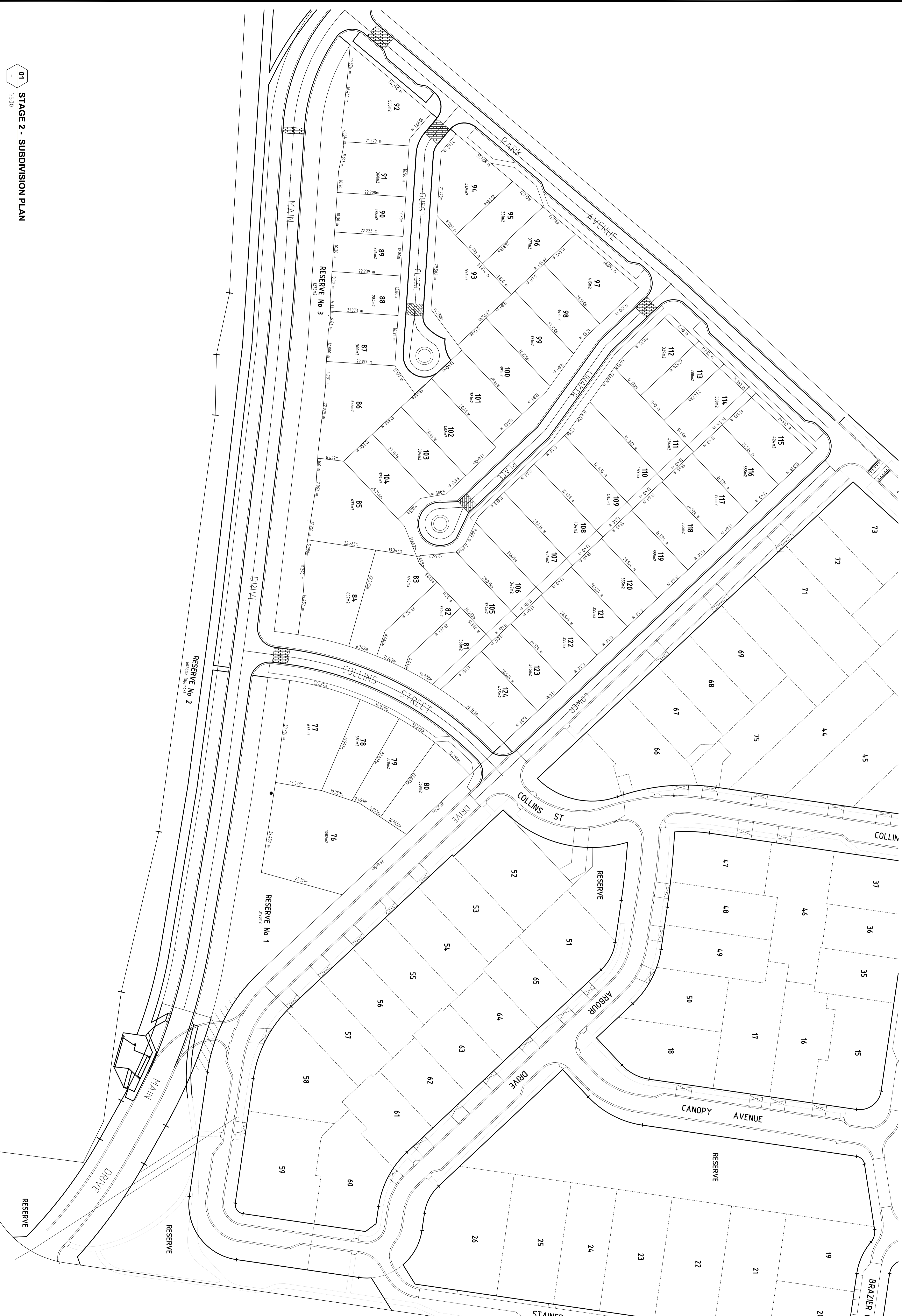
01 1500 STAGE 2 - SUBDIVISION PLAN

NOTES: - FOOTPATHS AND ROAD PAVEMENT TREATMENT ARE NOT SHOWN. PROVIDED IN THE CONSTRUCTION PLANS TO BE SUBMITTED FOR RESPONSIBLE AUTHORITY. THESE PLANS AND ANY INFORMATION CONTAINED THEREIN ARE FOR INFORMATION ONLY AND DO NOT CONSTITUTE A CONTRACT. THESE PLANS ARE THE PROPERTY OF WALKER CORPORATION AND ARE NOT TO BE REPRODUCED OR TRANSMITTED IN ANY FORM OR BY ANY MEANS, ELECTRONIC OR MECHANICAL, INCLUDING PHOTOCOPYING, RECORDING, OR BY ANY INFORMATION STORAGE AND RETRIEVAL SYSTEM, WITHOUT THE WRITTEN PERMISSION OF WALKER CORPORATION.