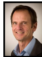
Cr Heinz Kreutz Mayor of Boroondara