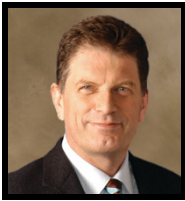
Ted Baillieu Premier of Victoria

The Premier, his Ministers, all Local Members of State Parliament, and the Mayor of Boroondara Council have been invited to speak.