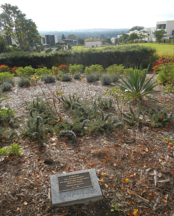
Longterm Residents Memorial