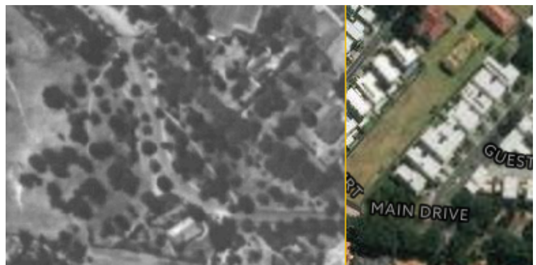
Stage 8 in Yarra Bend Grove Aerial Photo Link 1945.melbourne